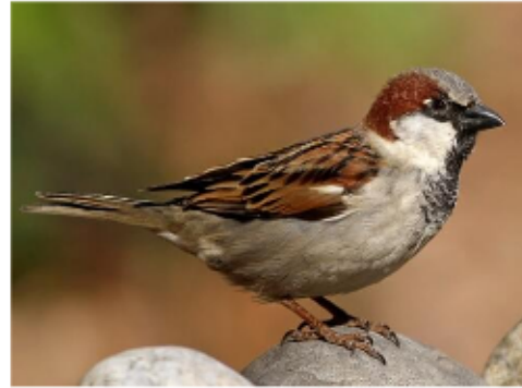
Figure 1. Perched house sparrow.